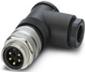
Sensor/actuator connector, male, angled, 5-pos., 7-8", screw connection, metal knurl, cable gland Pg13

Please be informed that the data shown in this PDF Document is generated from our Online Catalog. Please find the complete data in the user's documentation. Our General Terms of Use for Downloads are valid ( http://download.phoenixcontact.com )